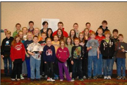
Military youth attendees at the 2012 State Youth Symposium in Fargo, ND on Mar 9-11.