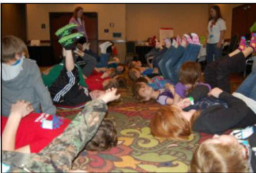
Youth square off in the banana relay at the 2012 State Youth Symposium in Fargo, ND on Mar 9-11.

April is "Month of the Military Child." Since 1986, the Department of Defense has teamed with various partners to recognize the sacrifices and to applaud the courage of military children. More than 1.7 million American children under the age of 18 have at least one parent serving in the military. It is estimated, the Army has more than 900,000 military children with one or both parents having deployed multiple times. Throughout April, local communities and communities nationwide will hold a variety of fun and exciting events for military children so all can recognize the sacrifices and challenges of military children.