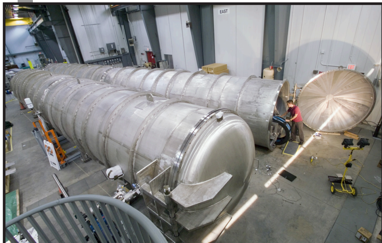
Detector tanks for the SANS instruments at HFIR. The Bio-SANS detector is on the left.

SANS instrument is supported by additional CSMB capabilities that include development of advanced computational tools for neutron analysis and modeling, as well as biophysical characterization and x-ray scattering infrastructure. A dedicated biological sample preparation laboratory is located adjacent to the instrument.