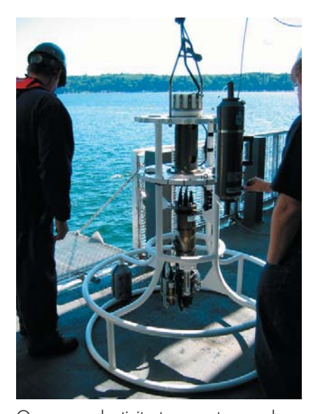
Ocean conductivity, temperature and depth (CTD) are measured.

Launched: October 17, 2003 Delivered: August 1, 2004 Commisssioned: May 28, 2005 Builder: VT Halter Marine, Inc., Moss Point, Mississippi