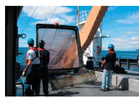
Crew members retrieve a net during sea trials.

Oscar Dyson is capable of conducting multidisciplinary oceanographic operations in support of biological, chemical, and physical process studies. The ship can complete oceanographic research consisting of deployment/recovering of floating and bottom-moored sensors arrays. The ship has a traction-type oceanographic winch that can deploy up to 5,000 meters of 17mm wire rope or other cable types in conjunction with the large stern A-frame. Two hydrographic winches serve the side sampling station via the side a-frame. Each hydrographic winch can deploy 3,500 meters of 9.5 mm electro-mechanical wire so that two scientific packages can be rigged and ready for sequential operations. Water conductivity, temperature, and fluorescence can be measured as a function of depth using the hydrographic winches and CTD system. In addition, capabilities are available for handling specialized gear such as MOCNESS frames, towed vehicles, dredges, and bottom corers. Surface currents are measured with an Acoustic Doppler Current Profiler, while a multibeam sonar system provides information on the content of the water column and on the type and topography of the seafloor while underway.