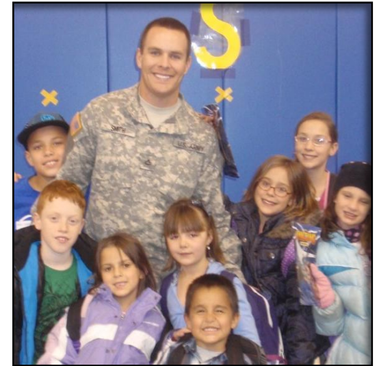
This soldier volunteers at the Good News Club at Gordon Elementary.