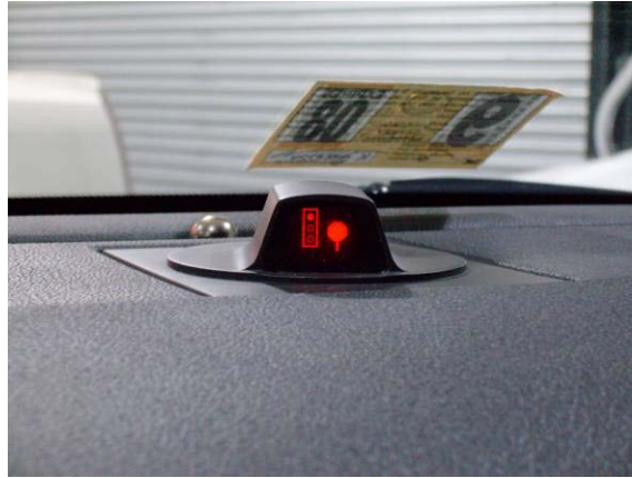
Figure 2 The visual display is located on the dash of the experimental vehicle.

The auditory warning consisted of a female voice stating either “Stop Light” or “Stop Sign”, presented at 72.6 dBA via the front speakers, measured at the location of the driver’s head. The visual warning (Figure 2) displayed a traffic signal and stop-sign icon from a high “head down” display located on top, center of the dashboard near the windshield. Finally, the haptic brake pulse warning consisted of a single 600 millisecond brake pulse (or vehicle jerk) presented in conjunction with the visual icon and an auditory warning.