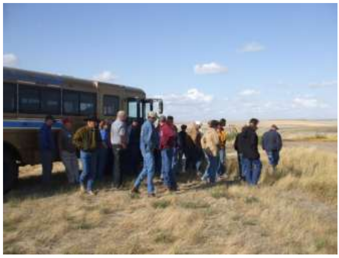
Joint Tour of the Valley Conservation District, the Milk River Watershed Alliance and the Glasgow SG-LWG

The Glasgow SG-LWG sponsored a joint public meeting December 15, 2009 " Winter Roundup with a Twist ". The workshop was co-sponsored with two other important conservation partners, Valley County Conservation District (VCCD) and the Milk River Watershed Alliance (MRWA).