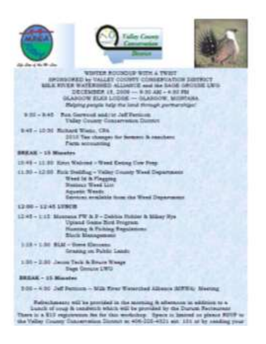
Program for "Winter Roundup with a Twist"