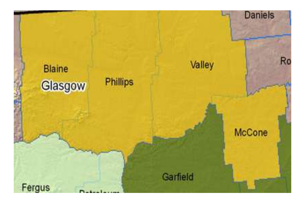
The Glasgow Sage-grouse Local Working Group Area Shown in Gold