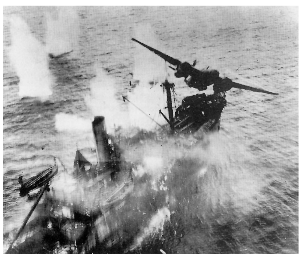
Figure 2: An A-20 from the 3rd Bombardment Group barely hit the mast of a Japanese freighter after a low-level skip bomb attack. This photo was taken during an attack on Japanese ships in the harbor at Rabaul, New Guinea. Major Raymond Wilkins was killed during the battle while exposing his aircraft to Japanese guns in order to allow the rest of his squadron to get clear of the heavy fire. He is one of two Medal of Honor recipients in the 3rd Wing's history.

firing .50 caliber machine guns, supplemented with two twin .50 caliber gun packages side mounted on the fuselage. The rear machine gun and lower turret were discarded. This change made the B-25 into a fearsome low-level attack plane. During the Bismarck Sea operations, pilots attacked ships from just above mast height, firing the forward firing machine guns to silence the ship's antiaircraft fire. This allowed the 90th Bombardment Squadron to score the most impressive hits of the battle with eleven of the twelve attacking B-25s scoring direct hits on Japanese ships. Later that afternoon, the 90th was one of the few squadrons that beat the weather to find the remnants of the convoy and claimed another eight hits on enemy ships. At least 12 Japanese ships were sunk and any pretenses they retained toward air superiority inexorably vanished.