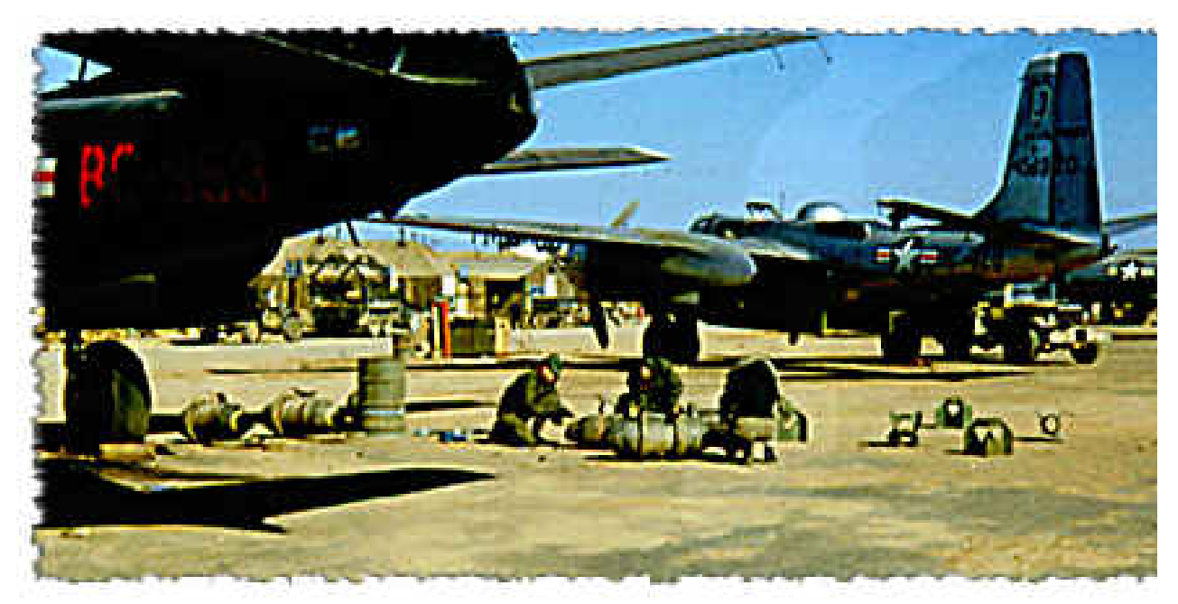
Figure 3: 3rd Bombardment Wing B-26s are prepared for the next night's missions at Kunsan Air Base, Korea during the Korean War.

After the end of World War II, the 3rd Bombardment Group moved to Iwakuni Air Base, Japan as part of the US occupation force. The group took on new peacetime missions in addition to its attack mission in the A-26, especially that of photographic reconnaissance in a motley assortment of aircraft from the F-2 (C-45 Expediter) to the F-9 (Photographic version of the B-17). On 18 August 1948, the new Air Force organizational configuration was in place, and the 3rd Wing was activated. Wings in the new Air Force were configured very closely to the organization of the old groups and the Air Force perpetuated the history of the 3rd Bombardment Group by bestowing its combat record and history on the newly formed 3rd Bombardment Wing.