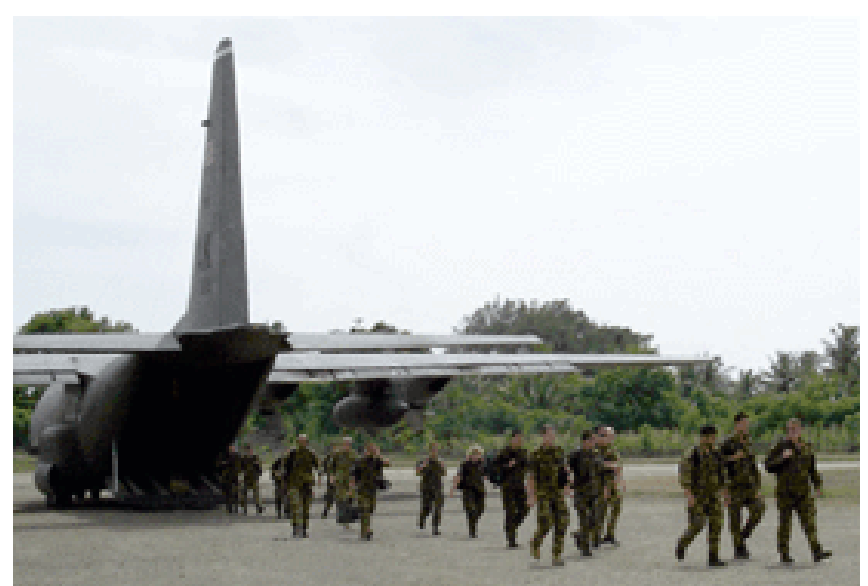
Figure 8: Passengers deplane from a 517th Airlift Squadron C-130 in East Timor during Operation STABILIZE in 1999.

The greatest single change to the wing in more than 50 years occurred in June 2010, when the Mission Support and Medical Groups inactivated as part of the joint base initiative as directed by Congress. When Joint Base Elmendorf-Richardson stood up, the 3rd Wing became a tenant organization on the base, supported by the 673rd Air Base Wing. This move left only the Operations and Maintenance Groups active within the wing but kept its mission essentially unchanged allowing the wing commander to focus on that mission.