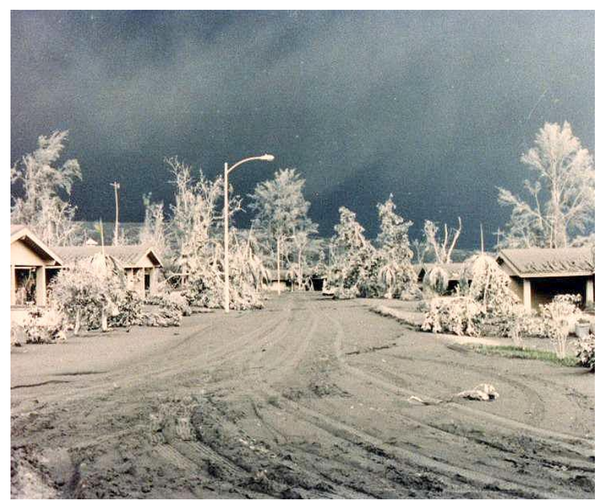
Figure 6: Base housing at Clark AB covered with ash after the eruption. Many buildings' roofs collapsed under the weight of the ash.

Political instability in the Republic became increasingly acute in the 1980s and governmental turmoil caused the wing to maintain a constant vigil. In 1986, the wing won another Air Force Outstanding Unit Award for supporting the Air Force mission during the tenuous transition of power from Ferdinand Marcos to the newly installed democratic government. After the fall of the Marcos regime, bases in the Philippines came under increased pressure from the newly elected government. Nationalists wanted an end to the American presence. Others wanted to renew the base treaties with the United States, but at an extremely high price. Negotiations with the Philippine Government plodded on for many months. The tension was palpable as increased terrorist activity began to restrict the free movement of U.S. personnel. This general instability required the wing to stand pat--sending only a detachment of F-4G Wild Weasel personnel, but no planes, to Operation Desert Storm.