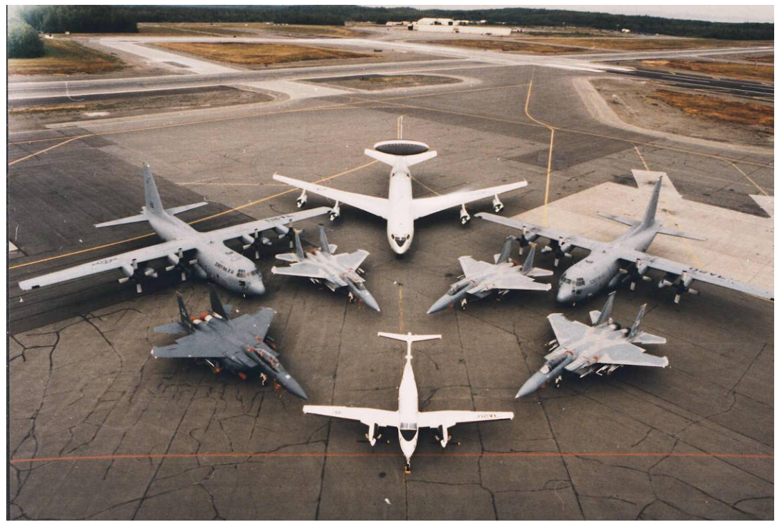
Figure 7: 3rd Wing aircraft, September 1993

Elmendorf AFB, near Anchorage, Alaska, the premier base of the Eleventh Air Force, proved to be the perfect location. Billy Mitchell considered Alaska the most strategic place in the world due to its proximity to the arctic air routes that greatly speeded travel to points around the globe. From its new home, the relocated wing could rapidly answer the call to move anywhere it was required. Redesignated the 3rd Wing in the months prior to its relocation to Alaska, the new name indicated a general mission carried out by many types of aircraft. Since 19 December 1991, the 3rd Wing has maintained vigil over the North Pacific.