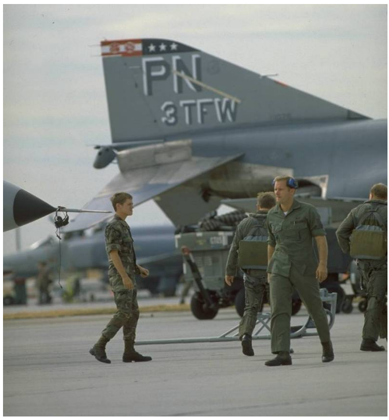
Figure 5: The 3rd Tactical Fighte Wing Commander's F-4 on the maintenance ramp at at Clark Air Base, Philippines in the late 1980s.

On 15 March 1971, the wing moved to Kunsan Air Base, Korea where it assimilated the equipment and personnel from the 475th Tactical Fighter Wing. Thousands of people witnessed the wing's rebirth as a formation of F-4Ds formed a three during a fly over. After becoming a proficient F-4 combat wing, the 3rd Tactical Fighter Wing moved to Clark AB, Republic of the Philippines on 18 September, 1974 replacing the 405th Fighter Wing, where it remained for 17 tumultuous years.