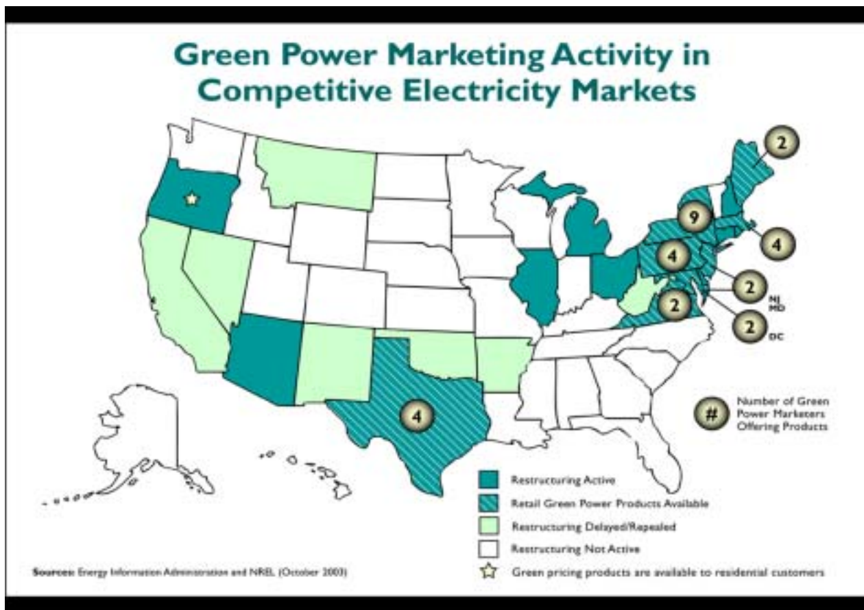
Figure 2: States With Competitive Green Power Offerings

During the past several years, about one-third of U.S. states have restructured their electricity markets to introduce retail service competition. 9 Currently, electricity consumers in the following states can purchase competitively marketed green power: Maine, Maryland, Massachusetts, New Jersey, New York, Pennsylvania, Texas, and Virginia, as well as the District of Columbia (see Figure 2 and Table A-3 ). 10,11