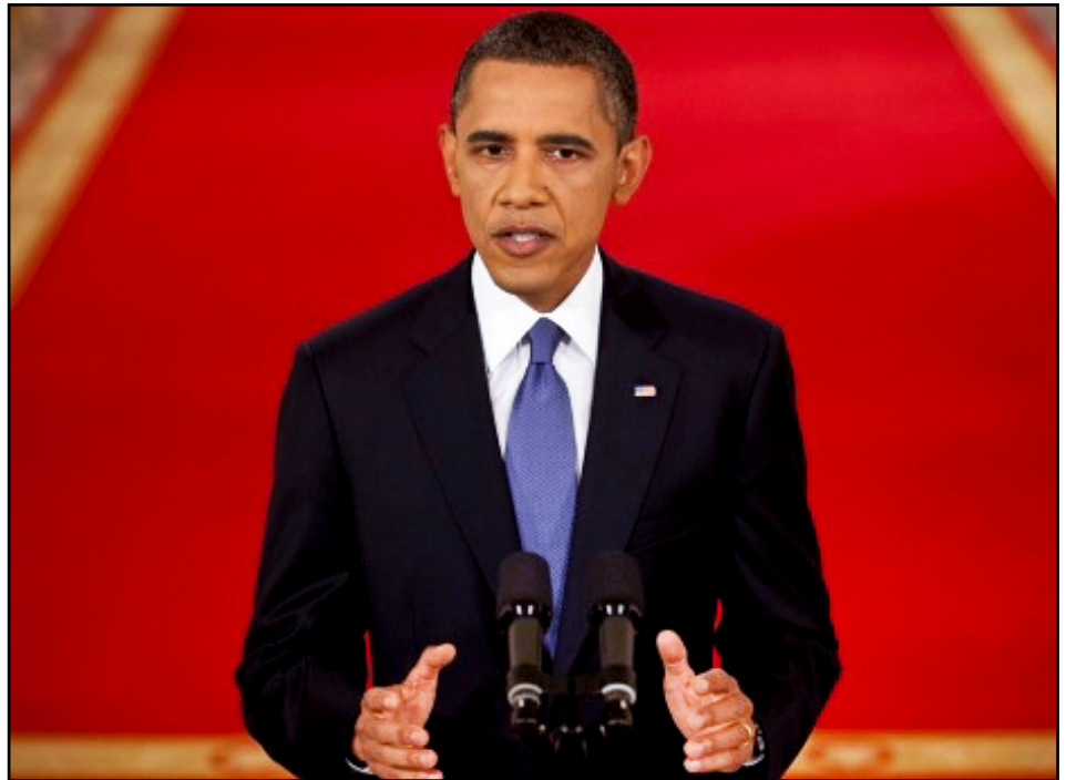
President Barack Obama addresses the nation about the way forward in Afghanistan and his plan to remove 10,000 American troops from the country by the end of this year June 22.

"Thanks to our men and women in uniform, our civilian personnel, and our many coalition partners, we are meeting our goals," he said. When the first stage of the draw-