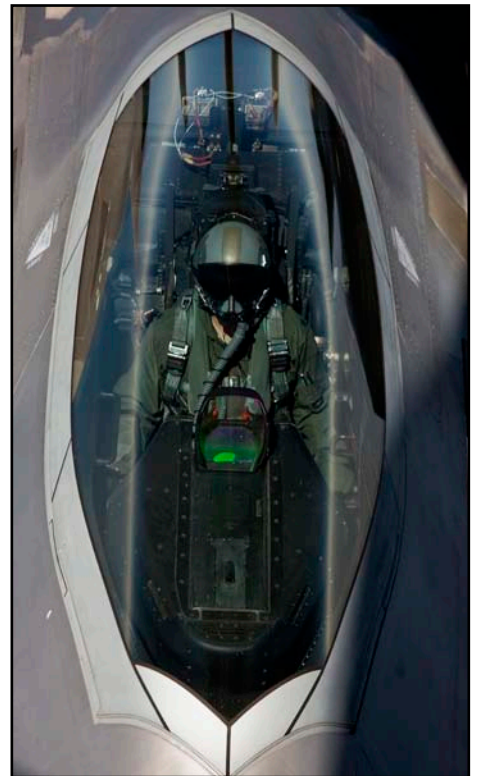
A 325th Fighter Wing F-22 Raptor pilot is seen in the cockpit of his aircraft during a refueling mission with a KC-135R Stratotanker from the 434th Air Refueling Wing March 18. The refueling mission gave both the F-22 pilot and the KC-135 crew valuable experience and training in aerial refueling, which is vital to keeping them world-wide mission ready.