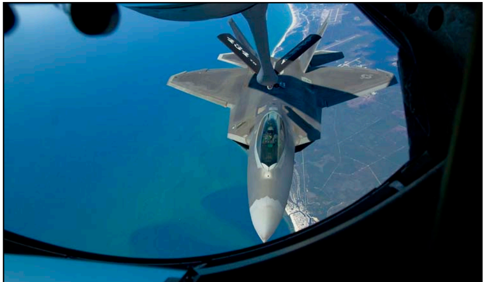
An F-22 Raptor from the 325th Fighter Wing prepares to connect to a KC-135 Stratotanker refueling boom over Tyndall Air Force Base, Fla. March 18. Aerial refueling acts as a force multiplier for aircraft, allowing them to stay airborne longer and extending their reach. The KC-135 is from the 434th Air Refueling Wing at Grissom Air Reserve Base, Ind., which is the largest KC-135 unit in the Air Force Reserve Command.