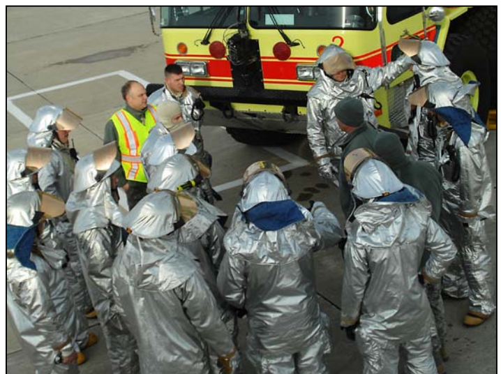
RIGHT: Firefighters meet to discuss procedures before their second run through during a recent training exercise.