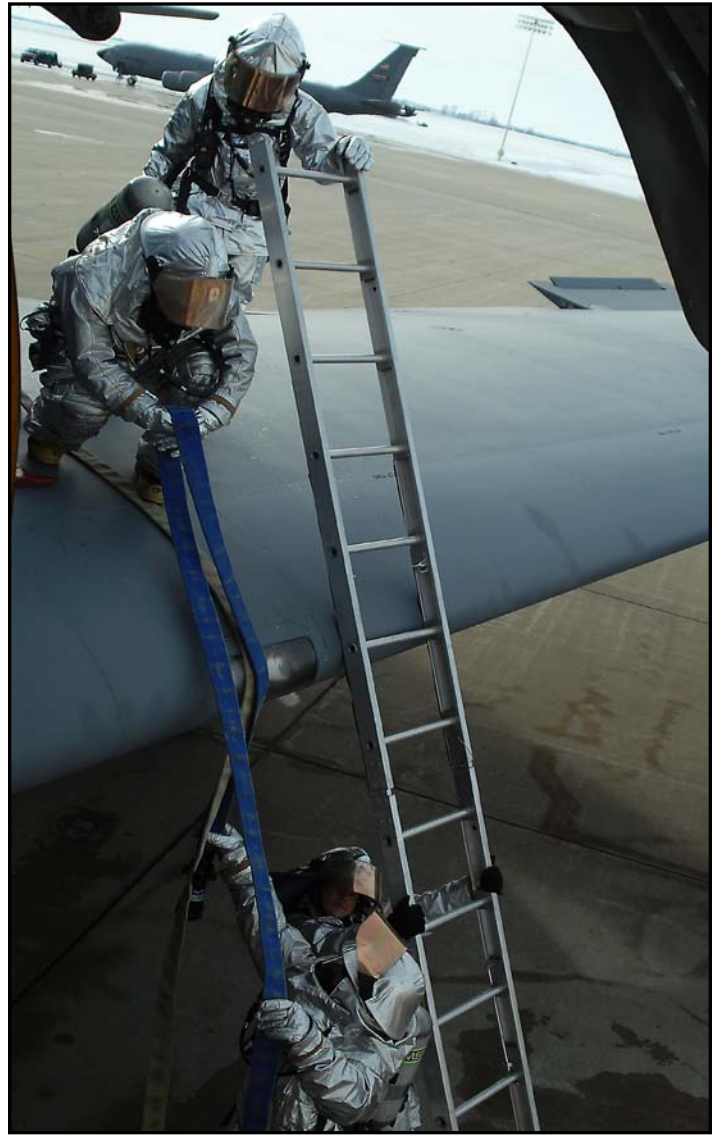
Grissom firefighters carefully take a firehose off of the KC-135R Stratotanker after completing their training exercise on the airfield here recently.

“Some of the reservists here have no fire experience,” he said. “They’re students and teachers, paramedics or EMTs. All this training helps people get the training they need to get on with full-time fire departments.”