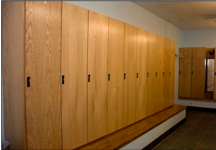
New wooden lockers were recently installed in the female and male locker rooms at the base fitness center.