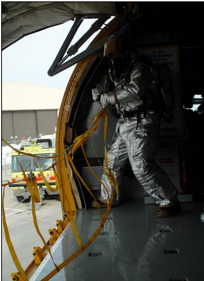
ABOVE: A firefighter hooks up a safety device during a recent training exercise.