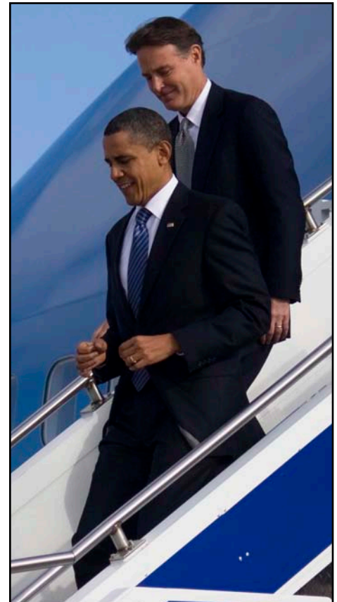
President Barack Obama deplanes Air Force One at Grissom as Senator Evan Bayh from Indiana follows Nov 23.

Both President Obama and Vice President Biden left Grissom to visit several places in nearby