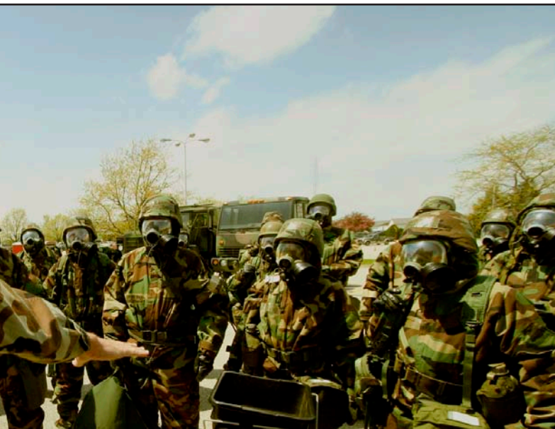
Squadron, instructs a group of Airmen on hazards they may eld. As part of their "Ability to Survive and Operate" training, Airmen ork while wearing chemical warfare suits and gas masks.