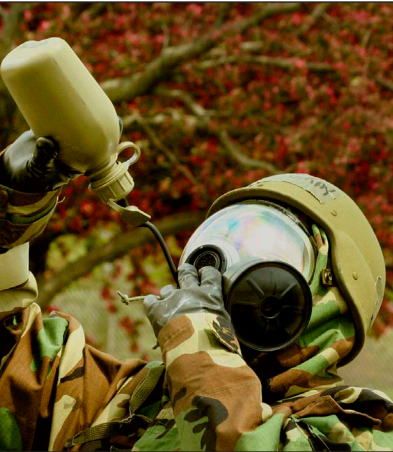
ations Squadron, watches an Airman get a drink of water while in his ersonnel participated in chemical, biological, radiation and nuclear, ng assembly.