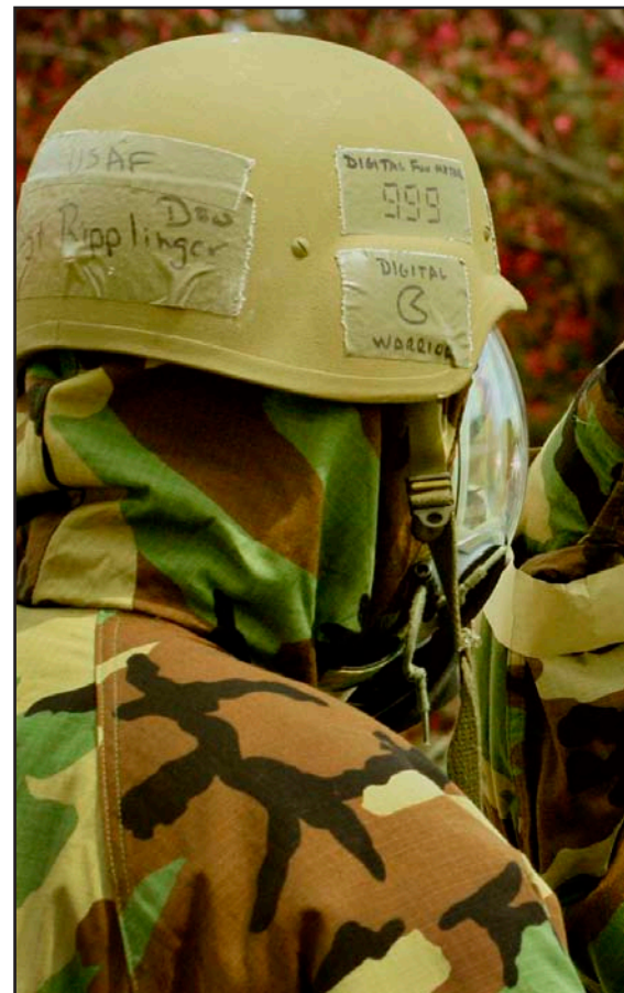
Master Sgt. Donald Ripplinger, 434th Communications Squadron, is seen in a chemical warfare suit. A large number of base personnel participated in CBRNE training during a recent unit training assembly.