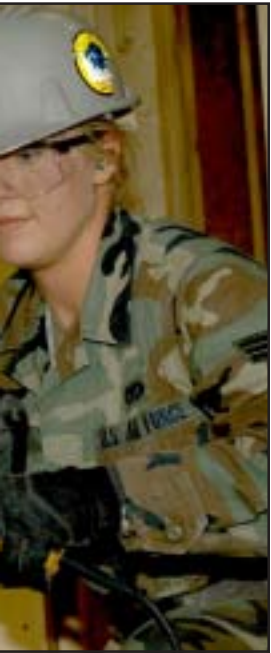
on apprentice, bores a uction.