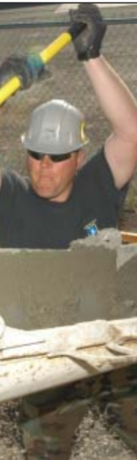
or, clears concrete out curb at the Southwest