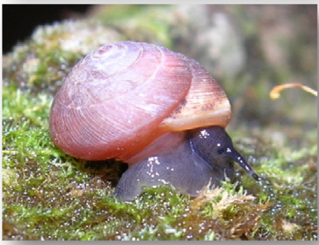
Twinflower ( Linnaea borealis ) and the cherrystone drop snail ( Hendersonia occulta ) are two Ice Mountain species that are usually found much farther north or at higher elevation.

Twinflower photo courtesy of Kent Mason Snail photo courtesy of Timothy Pearce, Carnegie Museum of Natural History