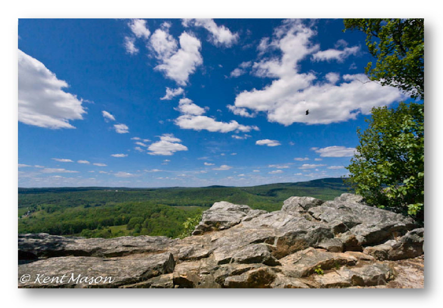
Guided hikes on Ice Mountain are possible by contacting volunteers for The Nature Conservancy. One trail up the mountain takes you to the ice vents, while a second leads to the scenic overlook, a habitat for ravens and bald eagles.

In 1989, The Nature Conservancy purchased 159 acres on Ice Mountain, including the entire algific talus slope, in order to protect its rare and fragile ecosystem. Working with public and private organizations, professionals and volunteers, the conservancy is trying to control invasive species and prevent the death of the hemlock tress that shade and cool the mountain's ice vents. They also cooperate on research into the formation and conservation of the ice vent system and are monitoring regeneration of the forest, which was damaged by a 2008 tornado. To strengthen these efforts and further protect the mountain, the conservancy applied to the National Park Service, in 2010, to make Ice Mountain Preserve a National Natural Landmark.