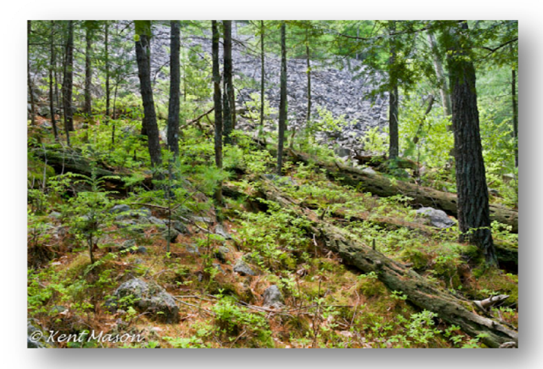
Tumbled-down boulders, called talus, on Ice Mountain's northwestern slope collect ice during the winter. In the summer, cold air flows out of vents in the base of the talus, lowering temperatures.

That's what it's called now by researchers like Dr. Hank Edenborn, who study these huge natural refrigerators. Ice Mountain is actually a long ridge, running southwest to northeast, as do most of the ridges in the Allegheny Mountains. What makes it different from the other ridges that stripe West Virginia's eastern panhandle is the tumbled-down collection of sandstone boulders, called talus, piled on its northwestern face. Algific simply means the boulder-strewn slope is cold-producing, but it doesn't explain why. That's left to scientists like Edenborn.