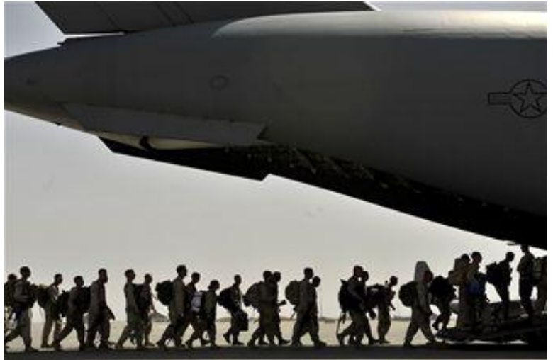
U.S. Marines board an Air Force C-17 Globemaster III during a redeployment mission at Camp Bastion, Afghanistan, Sept. 11, 2012. The Afghan National Security Forces and U.S. forces have worked closely and effectively to transition control of security in Afghanistan.

Approximately 70 Airmen with the 817th EAS have the rewarding and demanding job of bringing home servicemembers from Afghanistan. Though the majority of the squadron is from Joint Basis Lewis-McCord, Wash., the 817th EAS is a total force effort, including Pacific Air Forces, Air National Guard, and Reserves Airmen.