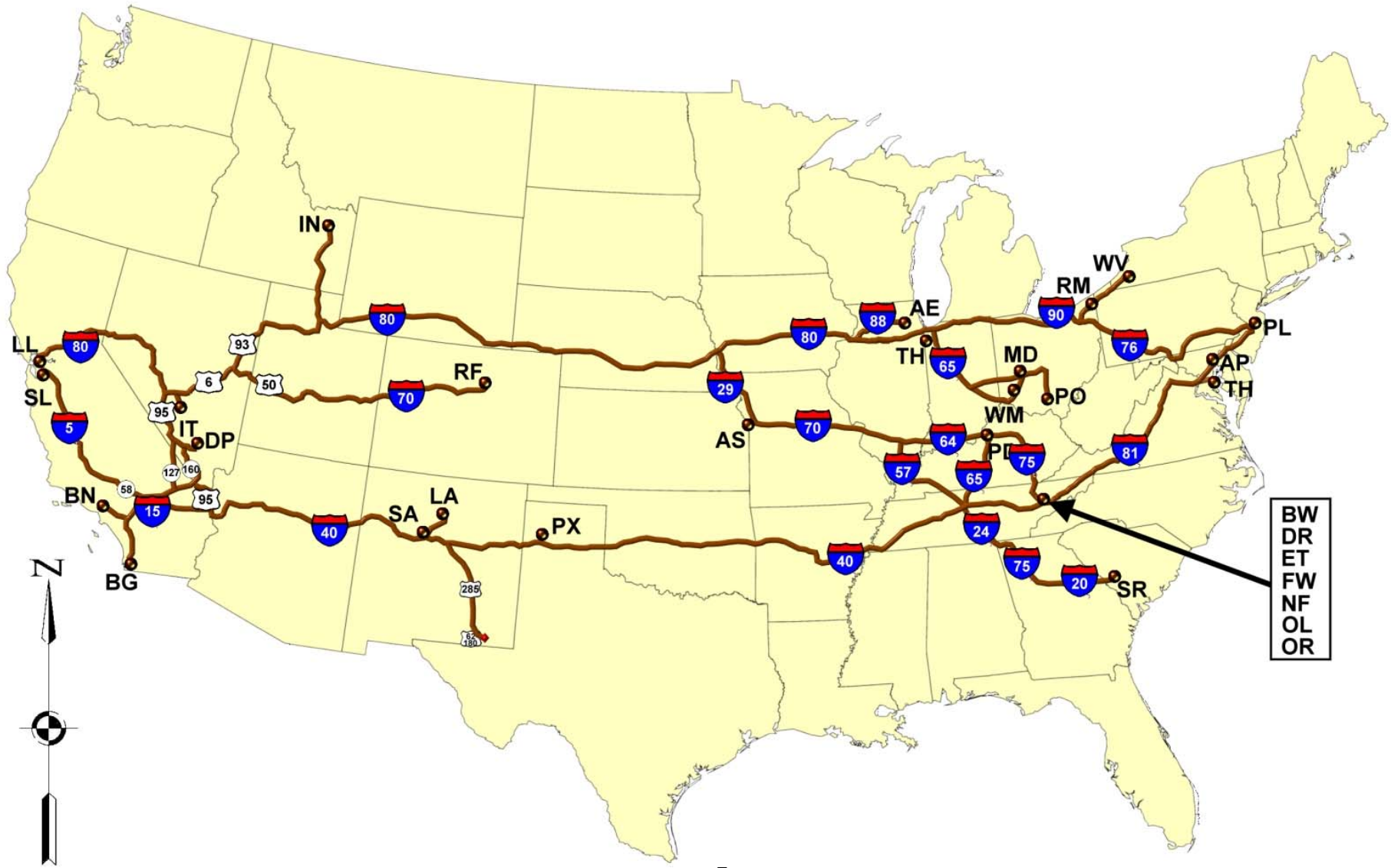
Figure 1 FY 2005 National Low-Level Waste General Transportation Routes