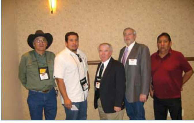
NIGC meets with Jicarilla Apache Tribe, New Mexico