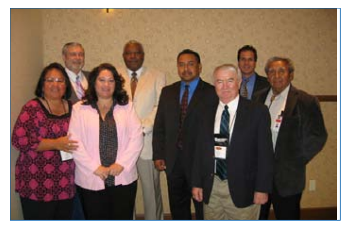
NIGC meets with Ak-Chin Indian Community