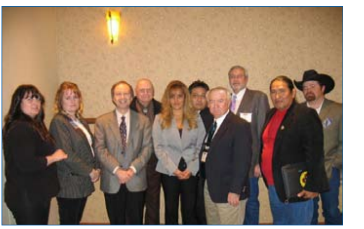
NIGC meets with Tonto Apache Tribe, Arizona