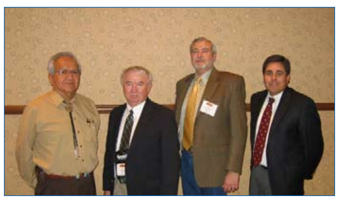
NIGC meets with Yavapai Apache, Prescott, Arizona