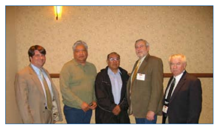
NIGC meets with Colorado River Indian Tribes