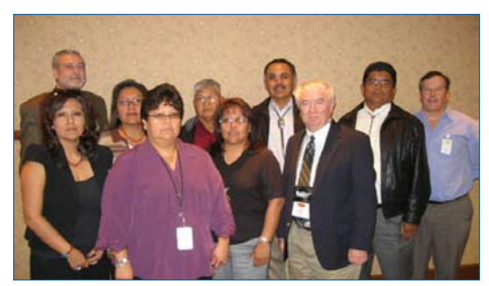
NIGC meets with San Carlos Apache Tribe