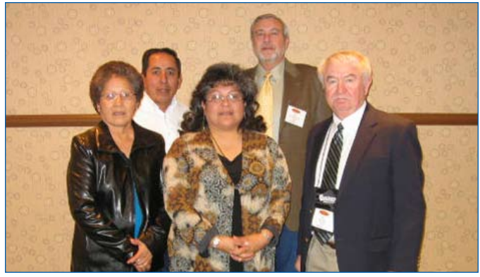
NIGC meets with Pueblo of Acoma