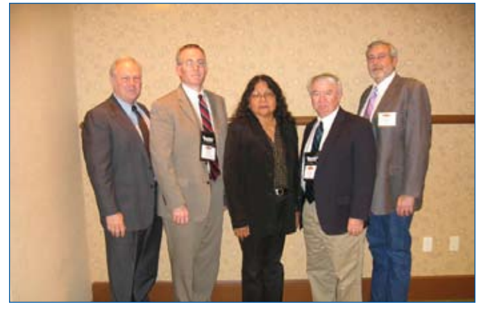
NIGC meets with Salt River Pima-Maricopa