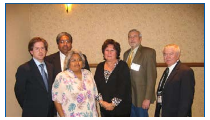
NIGC meets with Tohono O'odham Nation