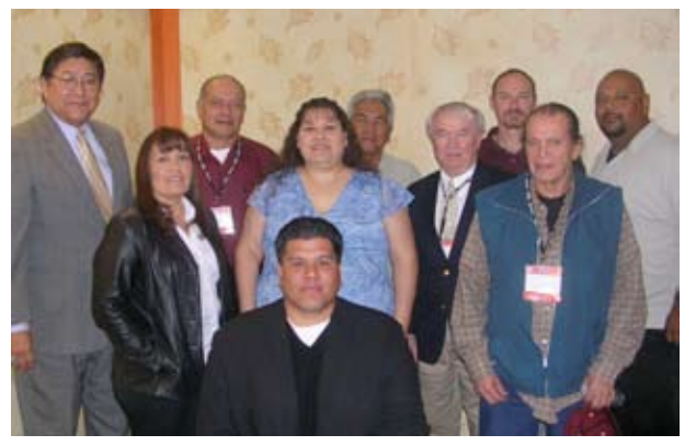
Sherwood Valley Rancheria