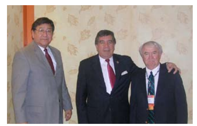
Agua Caliente Band of Cahuilla Indians.