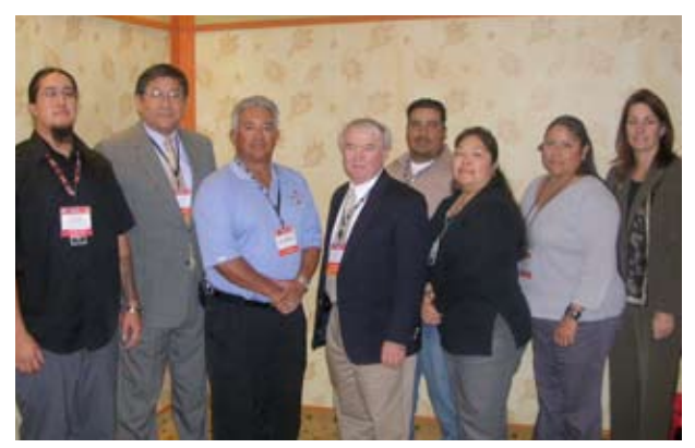
Pauma Band of Mission Indians