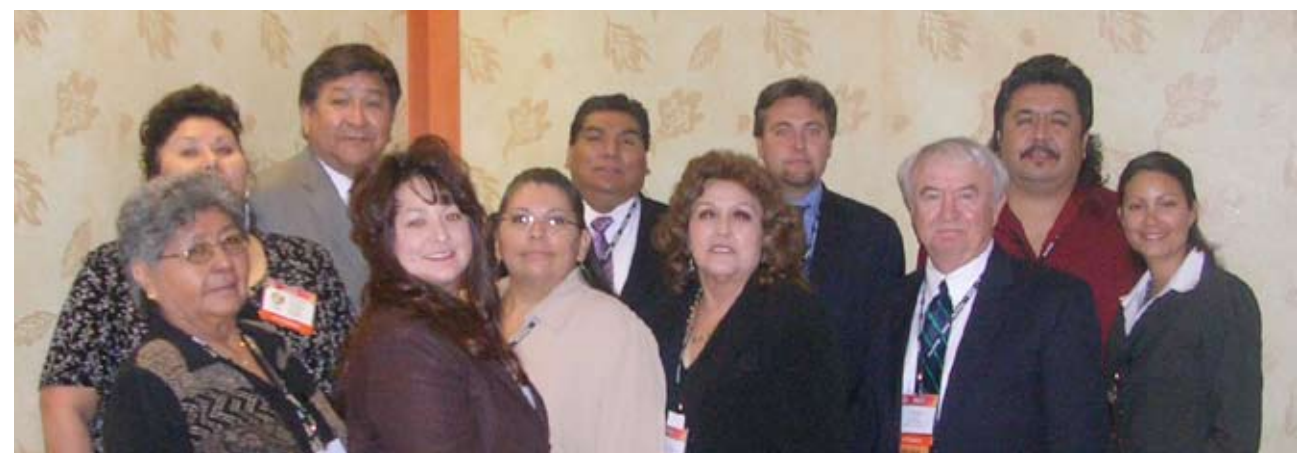
Washoe Tribe of Nevada