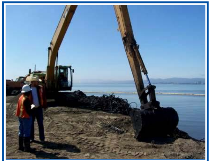
Long Reach Excavator for Offshore Work