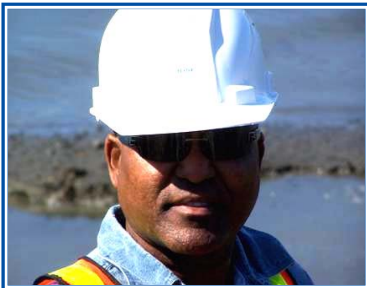
Navy Remedial Action Project Manager