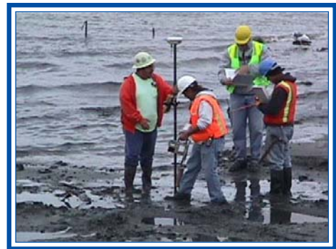
Post-Excavation Sampling at the Metal Debris Reef Area