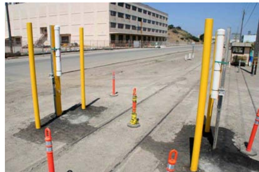
Portal Monitors at Parcel D