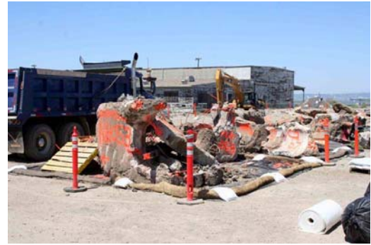
Concrete Encased Pipe