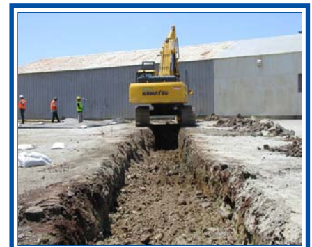
Parcel B Sewer Removal Construction