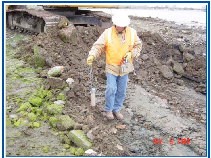
Technician Performing Radiological Scan While Excavating at Parcel E