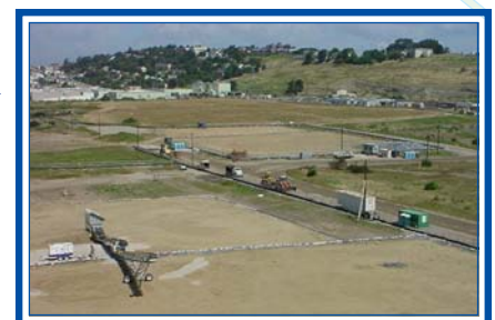
Aerial view of PCB Hot Spot and IR-02 Stockpile Areas