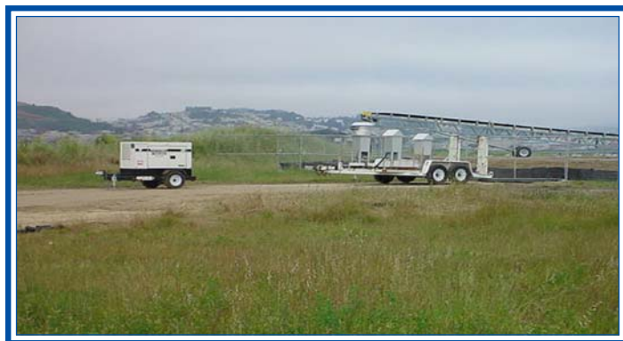
Air sampling equipment in place at IR-02