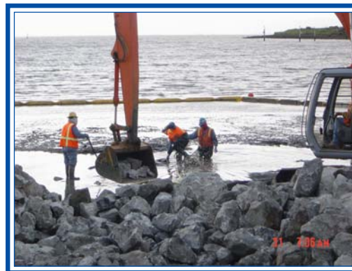
Armor Rock Placement at Metal Slag Area