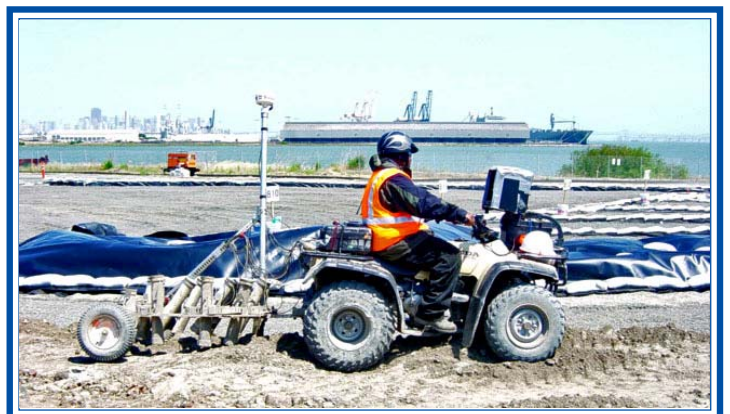
Radiological Soil Screening