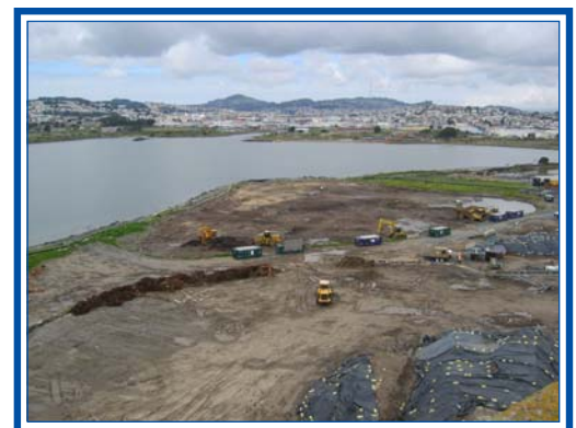
IR-02 Northwest and Central Excavation Area