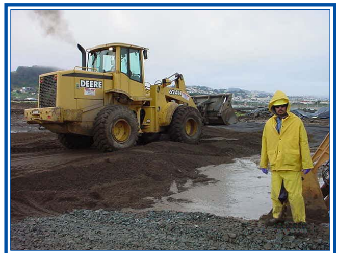
Construction of Clean Metal Laydown Area