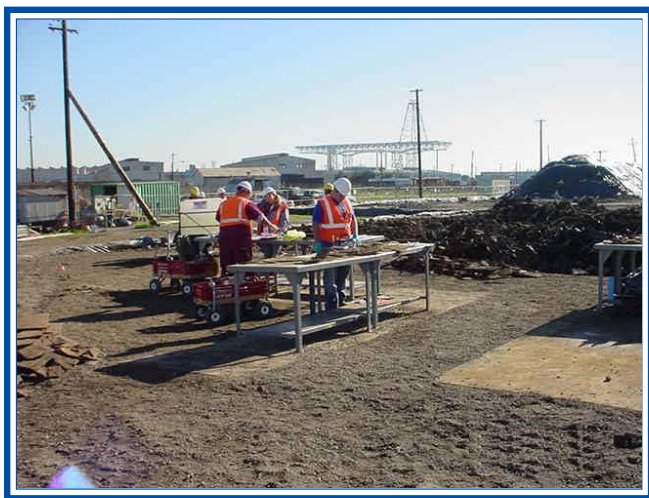
Release Surveying of Scrap Metal