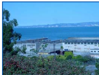
Parcel B Shoreline

This section summarizes key activities at each parcel completed during the past month and activities planned for the upcoming 2 months.