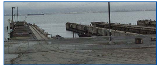
Dry Docks 5 and 7