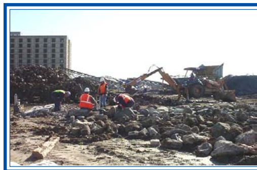
Performing RAD Release Surveys of Concrete Debris