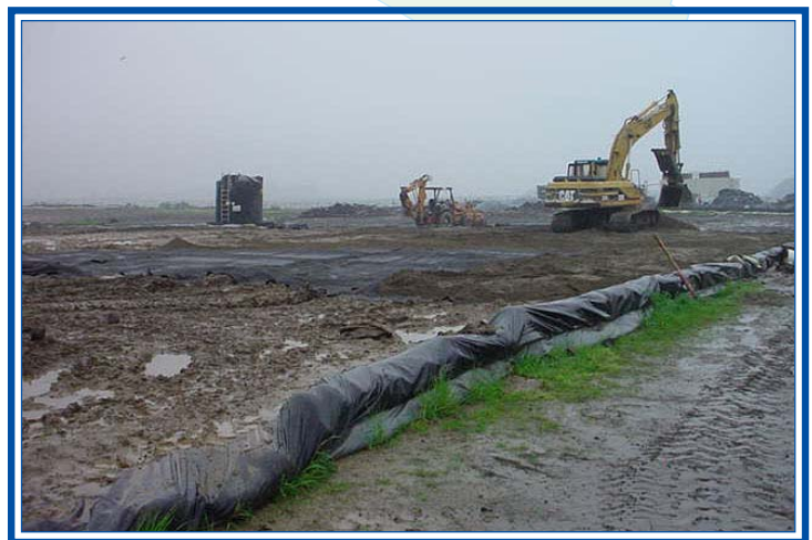
Improvements to Dewatering Pad for Metal Surveys