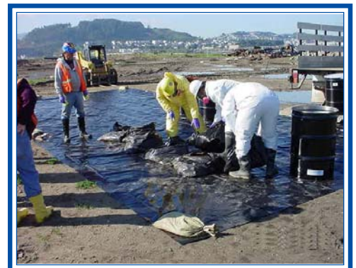
Preparation of collected wastes for radiological screening