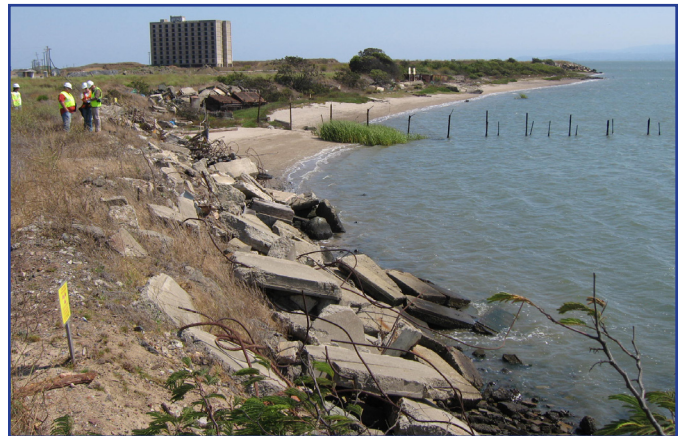
Shoreline Area Central and Southern Portion - View South

The above document describes the follow-up action that the Navy has selected to remove the PCB Hot Spots from Parcel E-2. To do this, the Navy will remove soil and sediment that are adjacent to San Francisco Bay. The City of San Francisco Redevelopment Plan is for these areas to be open space. This project will help meet this goal. This document is located on the BRAC PMO website and also in the Information Repositories, please see Page 7 of this fact sheet for more information.