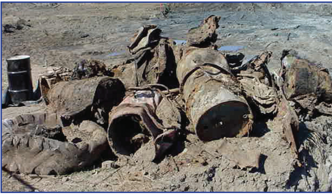
2005 Excavation Debris

not possible because of their proximity to San Francisco Bay. It was decided that additional information was necessary to define the extent and volume of the remaining Hot Spots. The Navy assessed the area and determined how much more soil and sediment would have to be removed in the Draft Final Remedial Investigation/Feasibility Study (RI/FS), which was completed in February 2009.