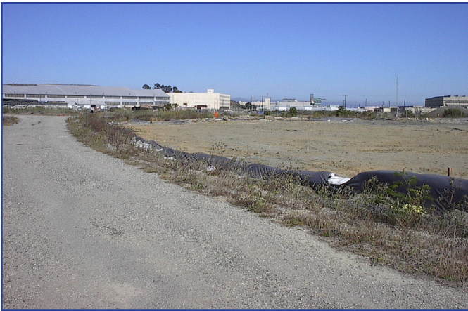
East Adjacent Area, Eastern Portion