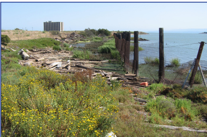
Shoreline Area Northern Portion - View South

The Navy was able to use the information and data from the 2005 project to plan follow-up work in order to remove the remaining Hot Spots. The current removal action will address the PCB Hot Spots along the Shoreline Area as well as Lead and PCB Hot Spots in the East Adjacent Area that were identified in the Remedial Investigation/Feasibility Study. The current project is described in the Parcel E-2 PCB Hot Spot TCRA Amended Action