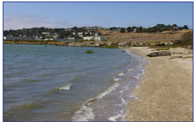
Shoreline Area, Central Portion - View North