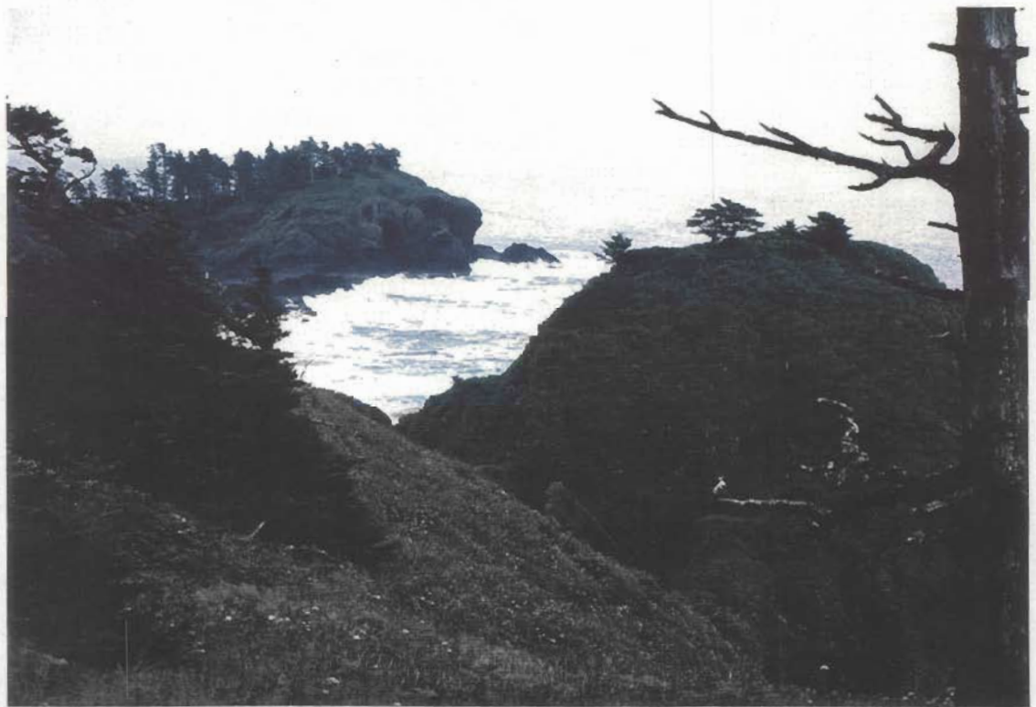
St. Lazaria Island southern end, view from sampling station.