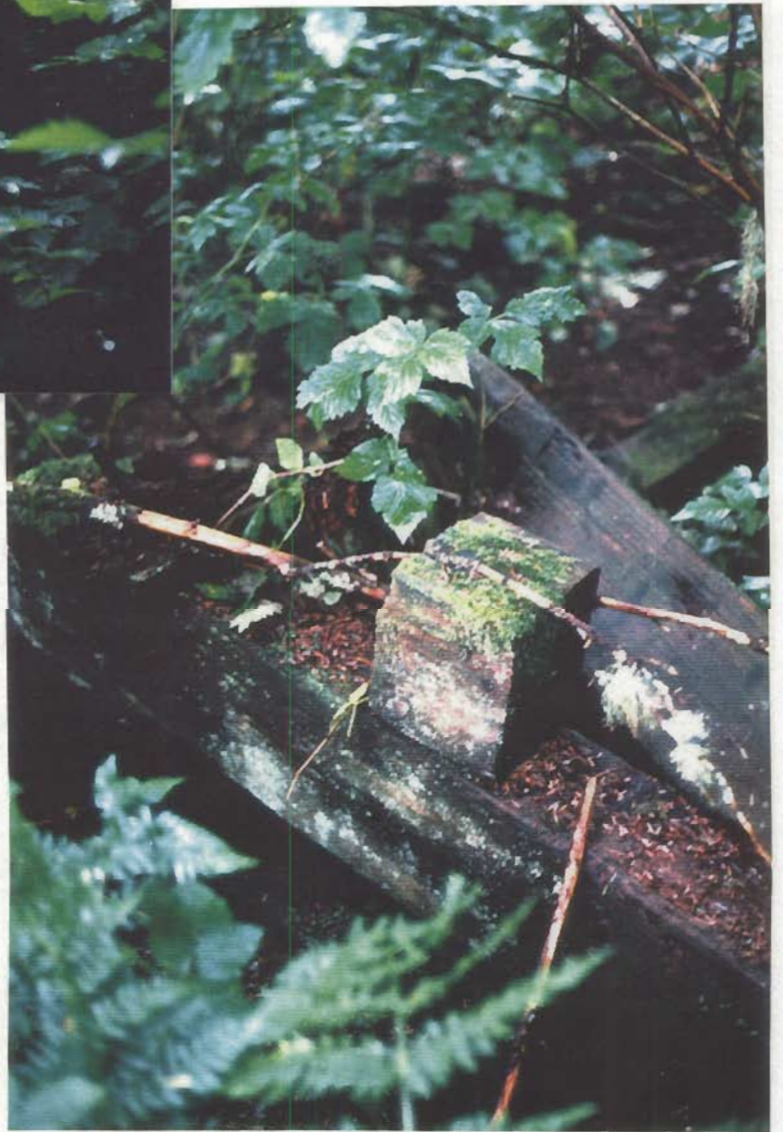
Building remains in vegetation.