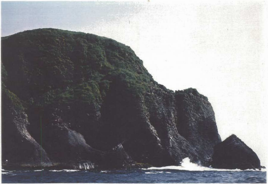
St. Lazaria Island northern end.