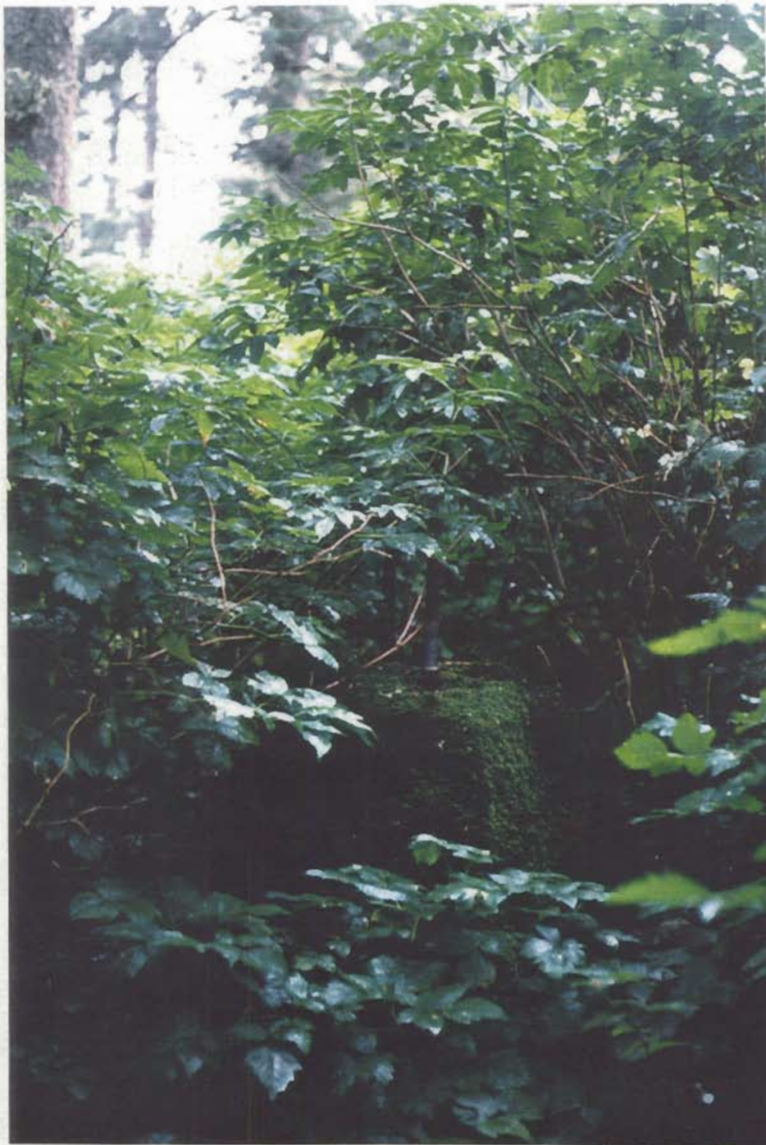
Antenna tower base in vegetation.