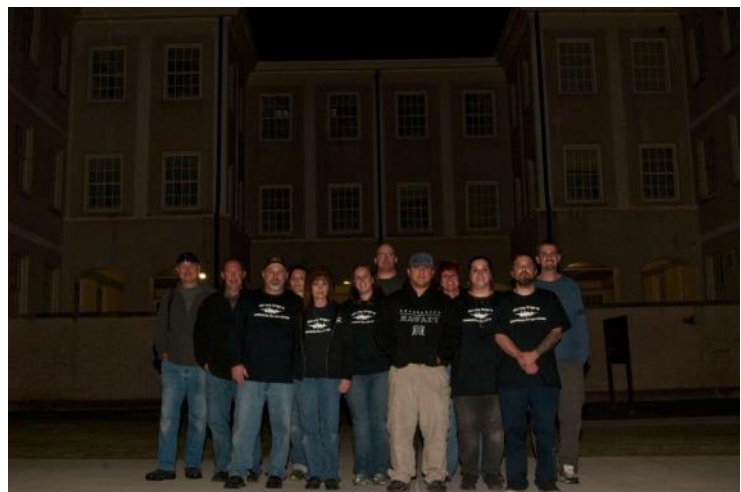
The teams from Night Whispers Paranormal Research and Southern Paranormal Society NC stop for a group picture at the end of their night in Fleming Hall, Pope Field, N.C., Oct. 13, 2012.