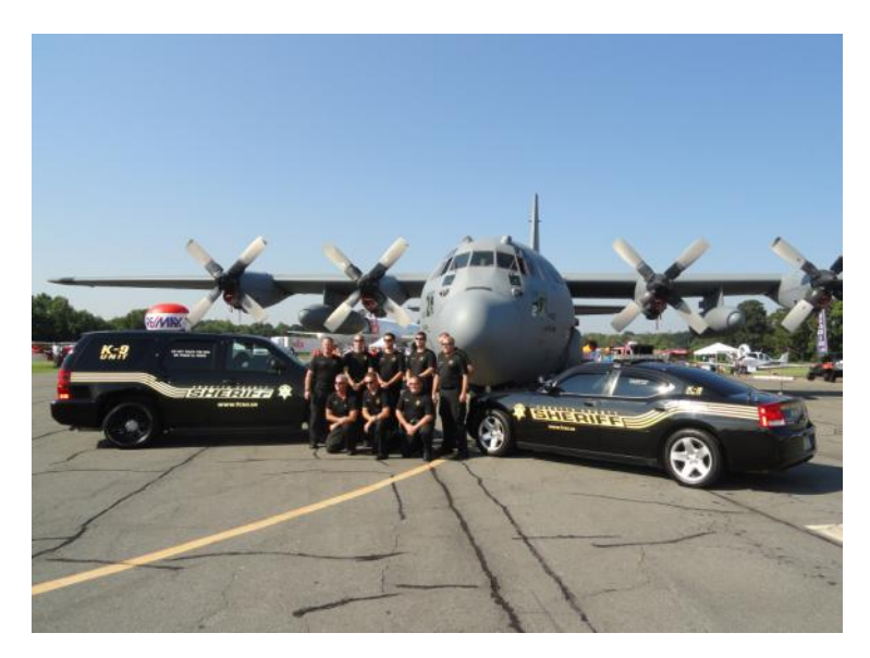
Members of the Forsyth County Sheriff's K-9 unit stop for a picture with the C-130 from Pope Field, N.C. at the Winston-Salem Air Show, August 25-26, 2012. The C-130 was on display for air show attendees to tour, ask questions and talk with crew members.