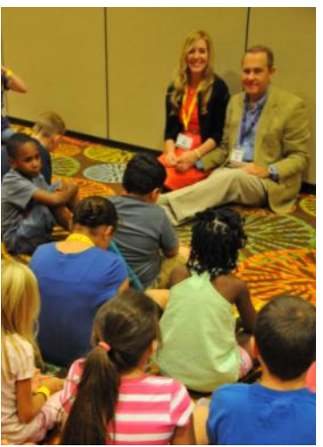
August Yellow Ribbon in Orlando,

Again, thanks for all you do for our country. It's an honor to serve with you. We are Pope!