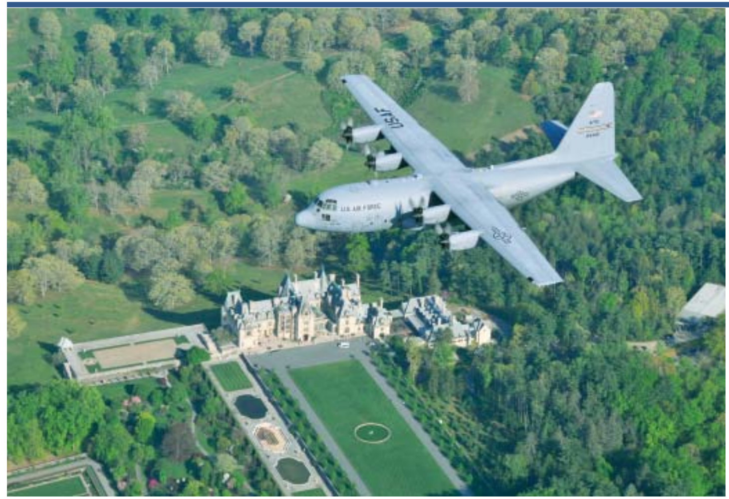
440th aircrew flew a C-130 over the Biltmore Estates in North Carolina during the first week of May.