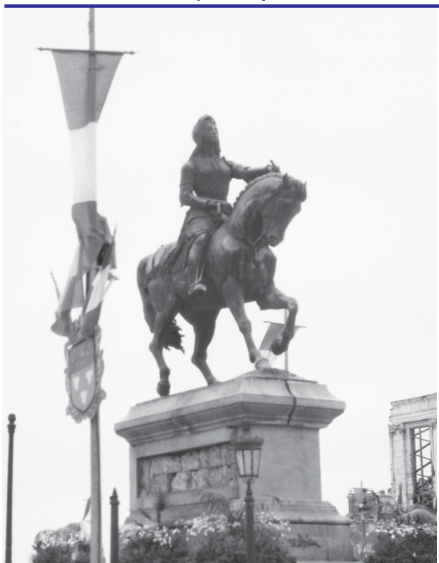
Page 16 The Combat Airlifter June 2008