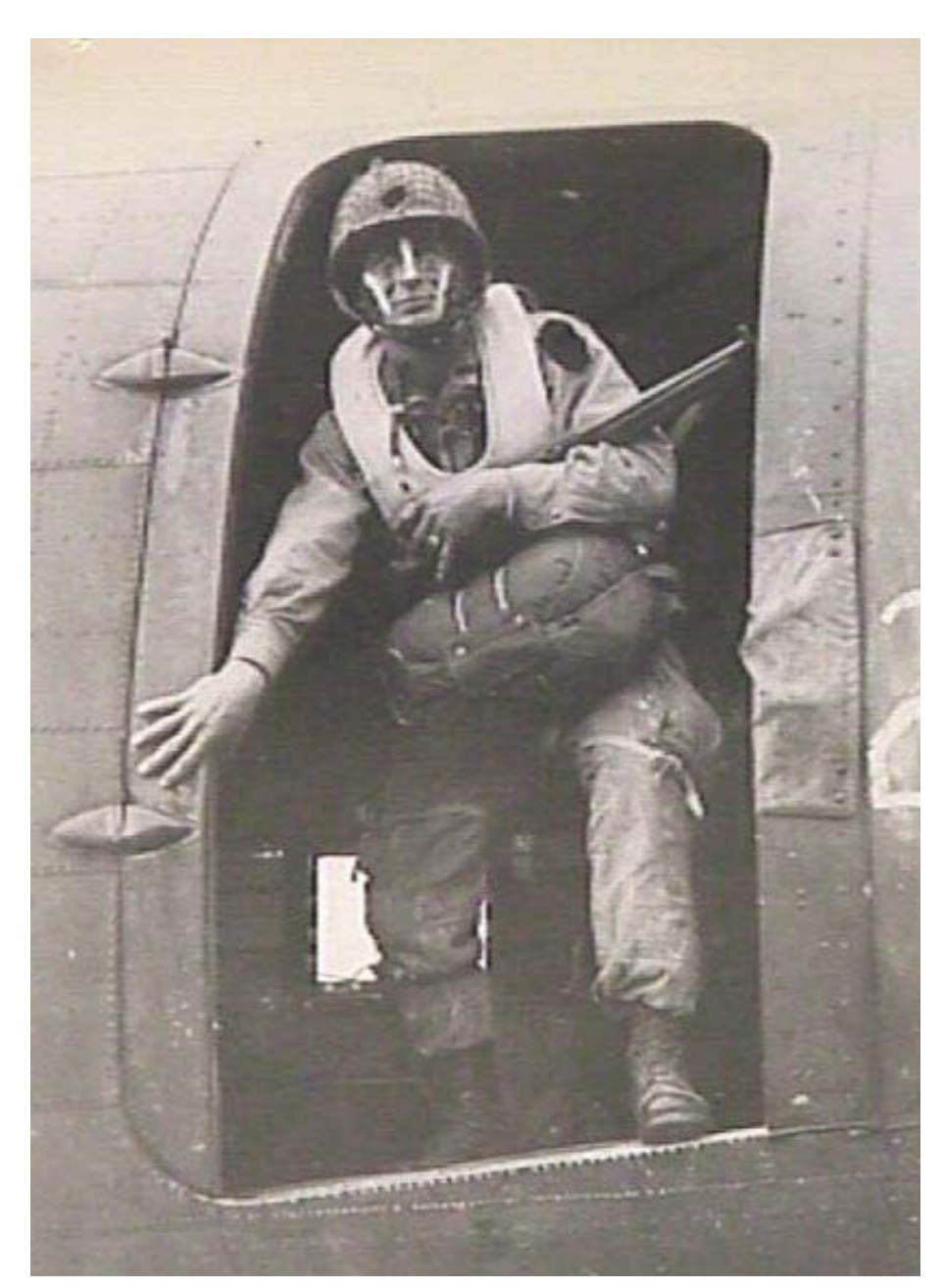
The "Filthy Thirteen" are a proud part of the 440th's history and legacy from World War II. The Filthy Thirteen quickly gained a reputation as tough and ready to fight anyone. The demolition mob of volunteers had the mission of parachuting behind enemy lines in the dark night prior to the land invasion of France. The book DZ Europe chronicles the story of the Filthy Thirteen and other heroes from World War II.