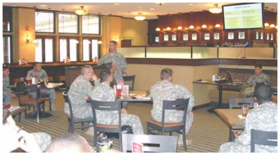
Part of the Ft. Bragg improvement strategy is "Iron Mike's," which offers Airmen and Soldiers food, a brew pub, plasma TVs and a relaxing atmosphere.