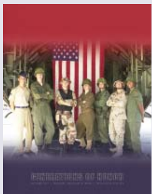
Chicago-area Civil Air Patrol cadets visit and help promote the wing's "Generations of Honor" event being held November 5, 2005.