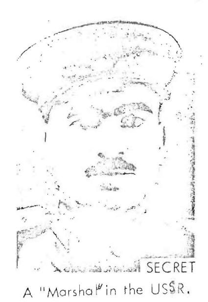
SECRET A later photo,