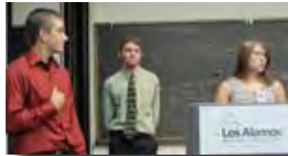
Students presentation on summer project work

Additionally, practical skill development in setting up, configuring, administering, testing, monitoring, and scheduling computer systems, supercomputer clusters, and computer networks will be emphasized and facilitated. Technical