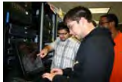
Students testing QDR Infiniband hardware

This highly-selective program is designed for third year (i.e., Junior) and above undergraduate students, although in some cases, Sophomore applicants may be considered. Acceptance into the program will be based on academic record (3.0 GPA minimum), interest and goal statement, and a letter of recommendation.