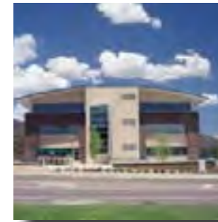
Los Alamos Research Park

As a general guideline, students should have experience with the LINUX operating system and sufficient academic achievement to make them eligible graduate school candidates upon completion of their undergraduate program. CS and EE/CE students from US universities will be considered. This program is limited to US citizens.