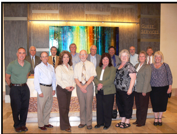
Chairs of EM Site-Specific Advisory Boards across the U.S. meet twice a year.

On June 15 and 16, 2011, representatives from community advisory boards across the nation convened in North Las Vegas, Nevada for the biannual Environmental Management Site-Specific Advisory Board (EM SSAB) Chairs Meeting . More than 50 SSAB members, staff, and speakers from eight sites throughout the country came together for the event to share important updates on environmental restoration, waste disposal, and budget activities relating to cleanup projects around the U.S. Department of Energy (DOE) Complex.