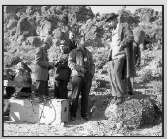
Journalists set up on News Nob to witness an atmospheric test in March 1953.

News Nob had a simple beginning. It received its name when a former Nevada Test Site construction worker who took a weather beaten board with a yellow door knob attached to it from an old outdoor lavatory and painted "This is News Nob" across the door in yellow. The original board is gone, but a replacement board still manages to hang onto to the side of the rock pile, despite years of wind and rain that tried to pry it loose from its precarious perch.