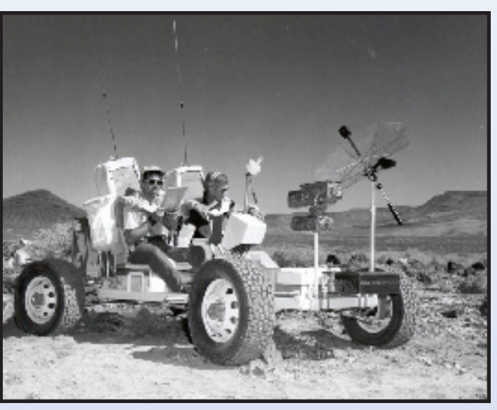
Apollo 16 astronauts in a moon rover in November 1970 near Schooner crater.