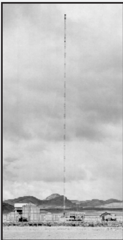
Japanese-style houses are shown in the foreground with the BREN Tower on Yucca Flat.

At 1,527 feet, the BREN (Bare Reactor Experiment -- Nevada) Tower is the largest free-standing structure west of the Mississippi River. It is also one of the best known and most visible landmarks at the Nevada Test Site, now known at the Nevada National Security Site (NNSS). It is taller than the Empire State Building (1,454 feet, to top of lightning rod) and almost twice as tall as the Eiffel Tower (1,063 feet, with antenna).