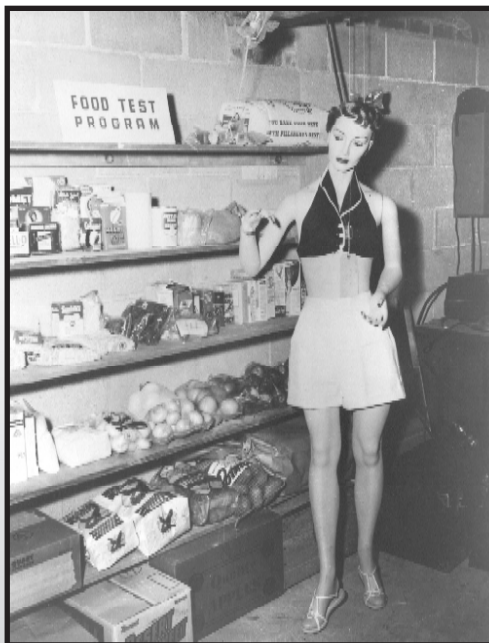
A mannequin poses in one of the houses built in Yucca Flat for the 29-kiloton Apple 2 test on May 5, 1955.

Today, houses that remain after the Apple 2 blast are a highpoint of the public tours that explore the Nevada National Security Site.