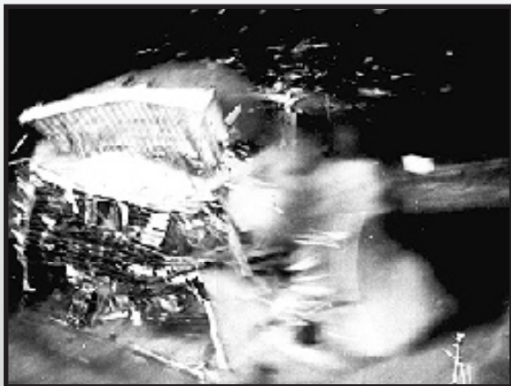
"Annie" a 16-kiloton atmospheric test fired from a tower on March 17, 1953, destroyed this house in less than three seconds.