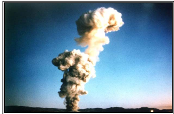
Recognizing characteristics of a smoke cloud from a nuclear detonation

For More Information, Contact CTOS at: National Nuclear Security Administration/Nevada Site Office Counter Terrorism Operations Support Program P.O. Box 98521, M/S NLV126, Las Vegas, NV 89193-8521 877.WMD.CTOS (963.2867) • 702.295.3224 Fax: 702.537.2639 E-mail: ctosmtrnr@nv.doe.gov www.ctosnnsa.org