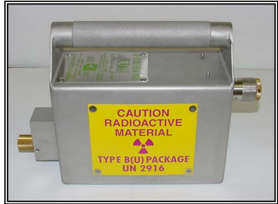
Typical radiography camera that could be stolen for illicit use