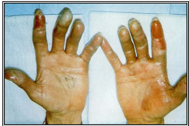
Recognize the characteristics of radiation burns as compared to thermal burns