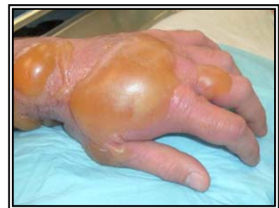
Recognize the effects of a chemical blister agent

For More Information, Contact CTOS at: National Nuclear Security Administration/Nevada Site Office Counter Terrorism Operations Support Program P.O. Box 98521, M/S NLV126, Las Vegas, NV 89193-8521 877.WMD.CTOS (963.2867) • 702.295.3224 Fax: 702.537.2639 E-mail: ctosmttreg@nv.doe.gov www.ctosnnsa.org