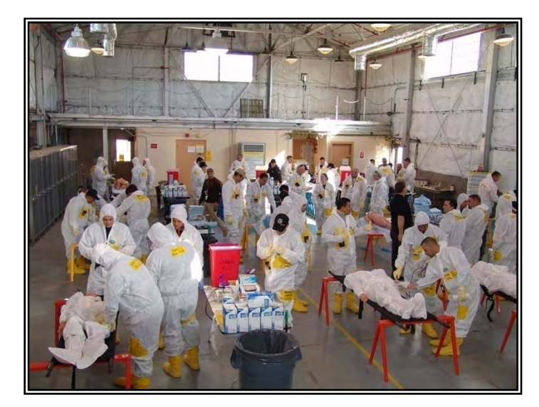
Decontamination exercise on simulated victims of an RED.