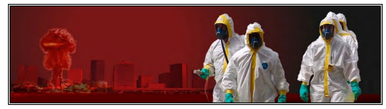
Rendered image of potential WMD attack