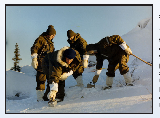
Team members, dressed in specially designed arctic clothing, begin the painstaking process of searching the area with hand-held radiation detectors.