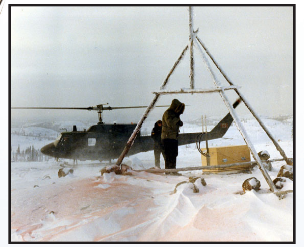
A microwave ranging transponder unit is placed under a landmark. The distance limitations of the units meant constant movement was necessary as the search moved along the footprint.