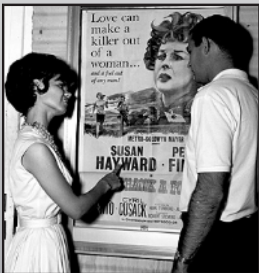
The movie theater at Mercury played current features for a nominal admission.

During the 1960s, the addition of the Plowshare Program and the Nuclear Rocket Development Station, activities involving the use of nuclear energy for peaceful purposes, led to the establishment of the NTS as year-round test site. The results of this increasing activity were evident in Mercury.