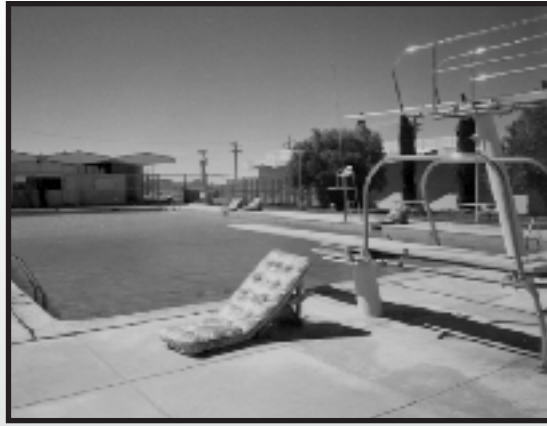
The Olympic-size Mercury swimming pool opened for business in 1964.

One of the larger, most anticipated construction projects was the Mercury Cafeteria and Steakhouse. Food facilities consultants studied the special feeding problems and overcrowding at Mercury mess halls and worked with the architect/engineer to design the new cafeteria's kitchen and serving areas. Trays used in the new cafeteria had a modified triangle shape so that four trays would fit on one table, a design that is still used in the cafeteria today. The cafeteria combined style with function: the perforated block wall was not used just for aesthetics - the wall assists in the heating and cooling of the cafeteria. Upon its completion, the new cafeteria had a total seating capacity of 800, and a steakhouse to provide a more elegant dining experience.