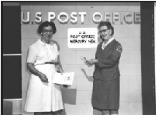
The Mercury Post Office on opening day, October 1964.

Almost one hundred years later the Atomic Energy Commission (AEC) built Mercury into a thriving area containing many of the facilities, services, and amenities as other small towns in the U.S., only without public access.