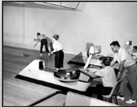
Mercury Bowl was a popular retreat after a long shift.

After a long shift, NTS workers could relax at a variety of new recreation facilities. A movie theater, established in a Quonset hut, showed current features such as " The Longest Day ," " Oklahoma ," and " West Side Story ." Mercury Bowl, the new eight-lane bowling alley opened on February 1, 1964 and contained a full-service snack bar. An Olympic-size swimming pool with bathroom and shower facilities opened that summer - season tickets were five dollars; daily admission was 50 cents. A recreation hall provided workers with areas for badminton, ping pong, square dancing classes, and bridge tournaments.