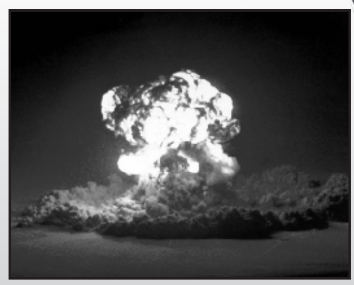
Boltzmann, the first test in the Plumbbob series, was a 12-kiloton weapons effects tower test conducted at the Nevada Test Site on May 28, 1957.

Nuclear tests were often conducted as part of a test series, a large scale operation where devices were detonated over a period of time - commonly a fiscal year. Test series were also issued a code name. For example, Operation Ranger was the first test series conducted at the Nevada Test Site and included the individual tests: Able, Baker, Easy, Baker-2, and Fox.