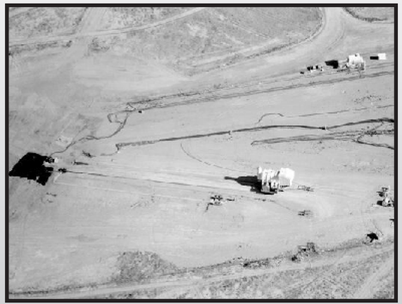
An aerial view of the Huron King test chamber (right) moments before the test in 1980.

conducted at the Nevada Test Site on June 24, 1980 by the Defense Nuclear Agency, now the Defense Threat Reduction Agency (DTRA), U.S. Department of Defense.