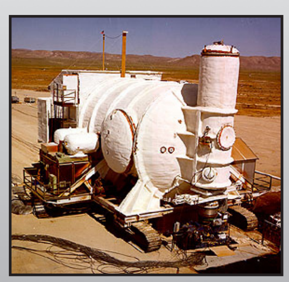
The Huron King test chamber is still located in Area 3 of the Nevada National Security Site.

For more information, contact: U.S. Department of Energy National Nuclear Security Administration Nevada Site Office Office of Public Affairs P.O. Box 98518 Las Vegas, NV 89193-8518 phone: 702-295-3521 fax: 702-295-0154 email: nevada@nv.doe.gov http://www.nv.energy.gov