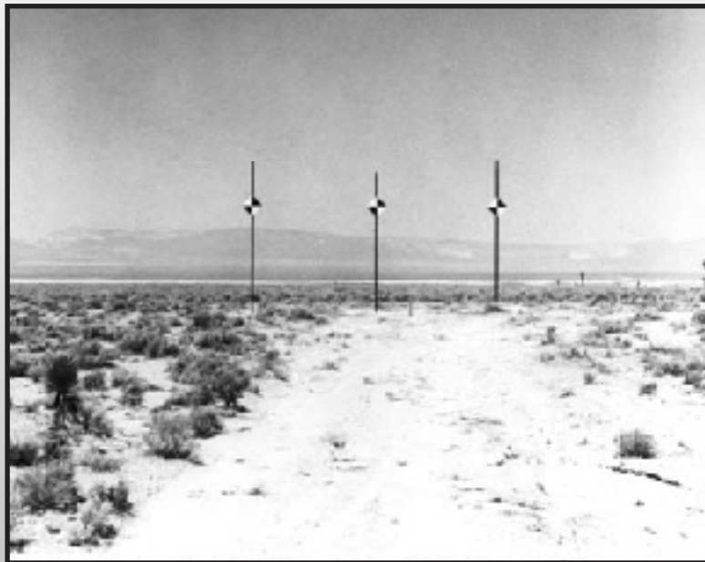
Bomb targets stand in Yucca Lake awaiting impact.

For two years, as the Salton Sea crew traveled back and forth to Yucca Flat as needed, several problems with Sandia's use of Yucca Flat as a test range became apparent. Sandia's testing came second to the use of Nevada Test Site for atmospheric and underground nuclear testing. While Yucca Flat was adequate for high-altitude drops, mountains on three sides obstructed aircraft approaches for low-altitude drop tests. Sandia also needed a hard concrete target to test low-altitude bomb drops onto enemy aircraft runways and concrete structures, and there was no such structure at Yucca Lake.