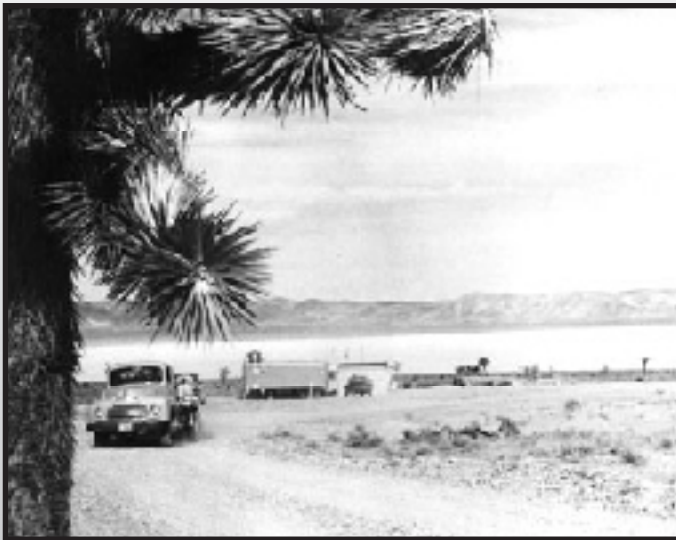
The Sandia crew sets up equipment to begin fuze testing at Yucca Lake on the Nevada Test Site.

A test base was established in the summer of 1946 on the shores of Salton Sea, California where Sandia Laboratory could conduct ballistic tests and monitor the operation of fuzing and firing systems. This area, then known as Sandy Beach, had been utilized by the Manhattan Project for ballistic and fuzing and firing testing of the first atomic weapons.