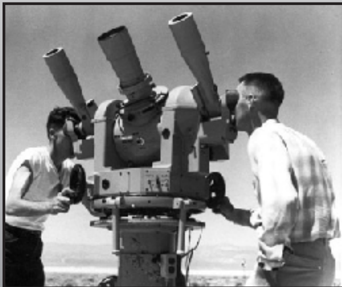
Special cameras are arranged to photograph the fuze testing on Yucca Lake.

combination of these devices. In the contact fuze, the force of impact closes a firing switch within the fuze to complete the firing circuit, detonating the warhead.