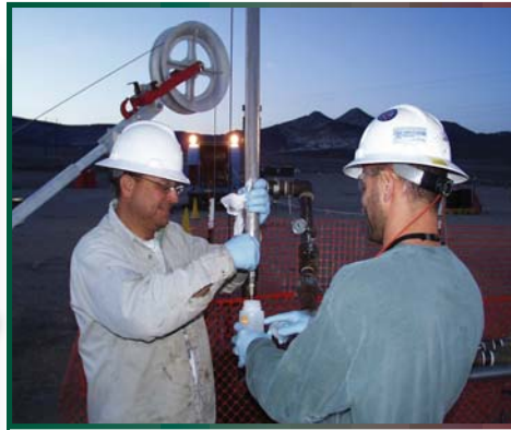
Workers take a water sample from a well drilled in the northwest portion of Yucca Flat - an area on the NNSS where hundreds of underground nuclear tests were conducted.