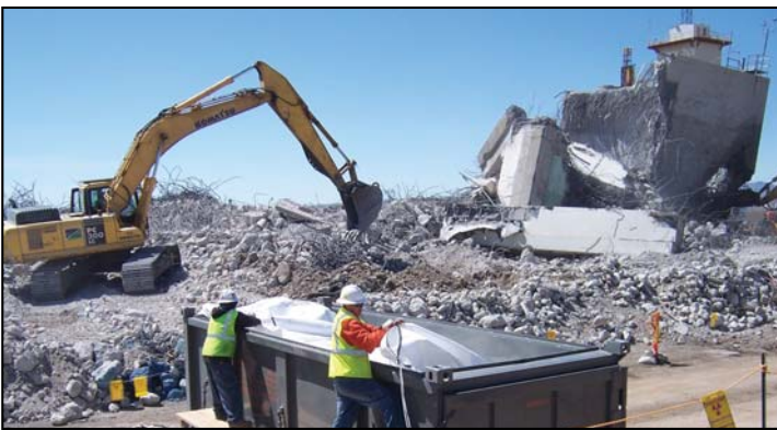
Workers close-up a container of low-level radioactive waste debris from the demolition of the Reactor Maintenance, Assembly, and Disassembly Facility used for nuclear rocket development at the NNS in the 1960s.

C ontamination has been identified in portions of the surface soil near historic atmospheric tests. The EM Program evaluates the extent of soil contamination resulting from atmospheric nuclear tests, safety experiments, and earth-cratering experiments. After the evaluation is complete, a remediation process is implemented upon approval by the State of Nevada.