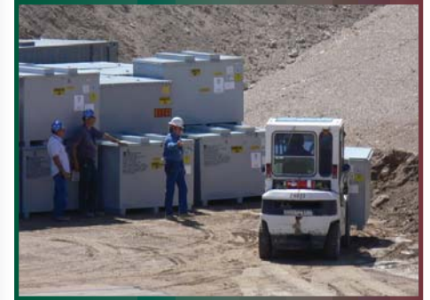
Workers place a metal box containing mixed low-level radioactive waste in a disposal cell at the Area 5 Radioactive Waste Management Complex located in the southeast portion of the NNSS.

Department of Defense sites across the country. Examples of this waste include contaminated construction debris, scrap metal, soil, and equipment. Some of this waste includes hazardous constituents. Waste is disposed in engineered cells