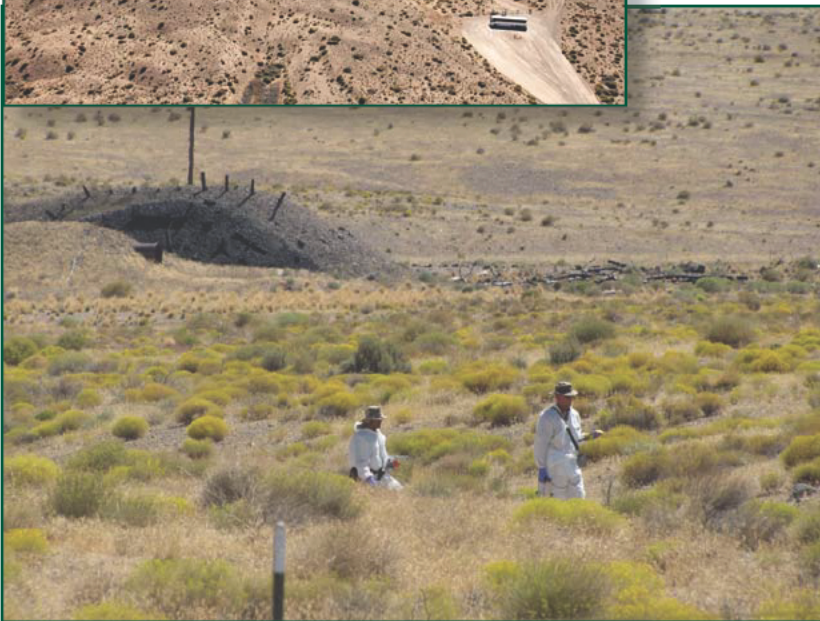
Top photo: The historic Sedan Crater has undergone a formal closure process.